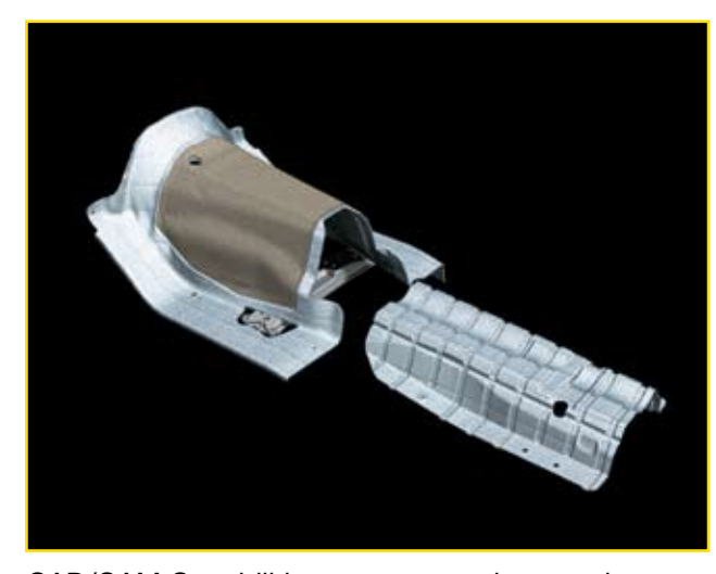
CAD/CAM Capabilities to create and customise shields.